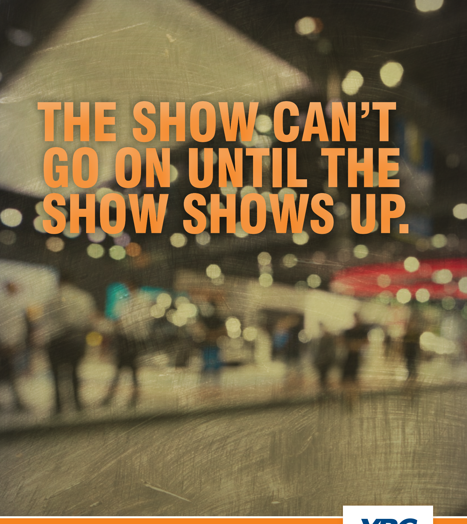
EXHIBIT SERVICES RELIABLE, AFFORDABLE SERVICE FOR TRADE SHOWS